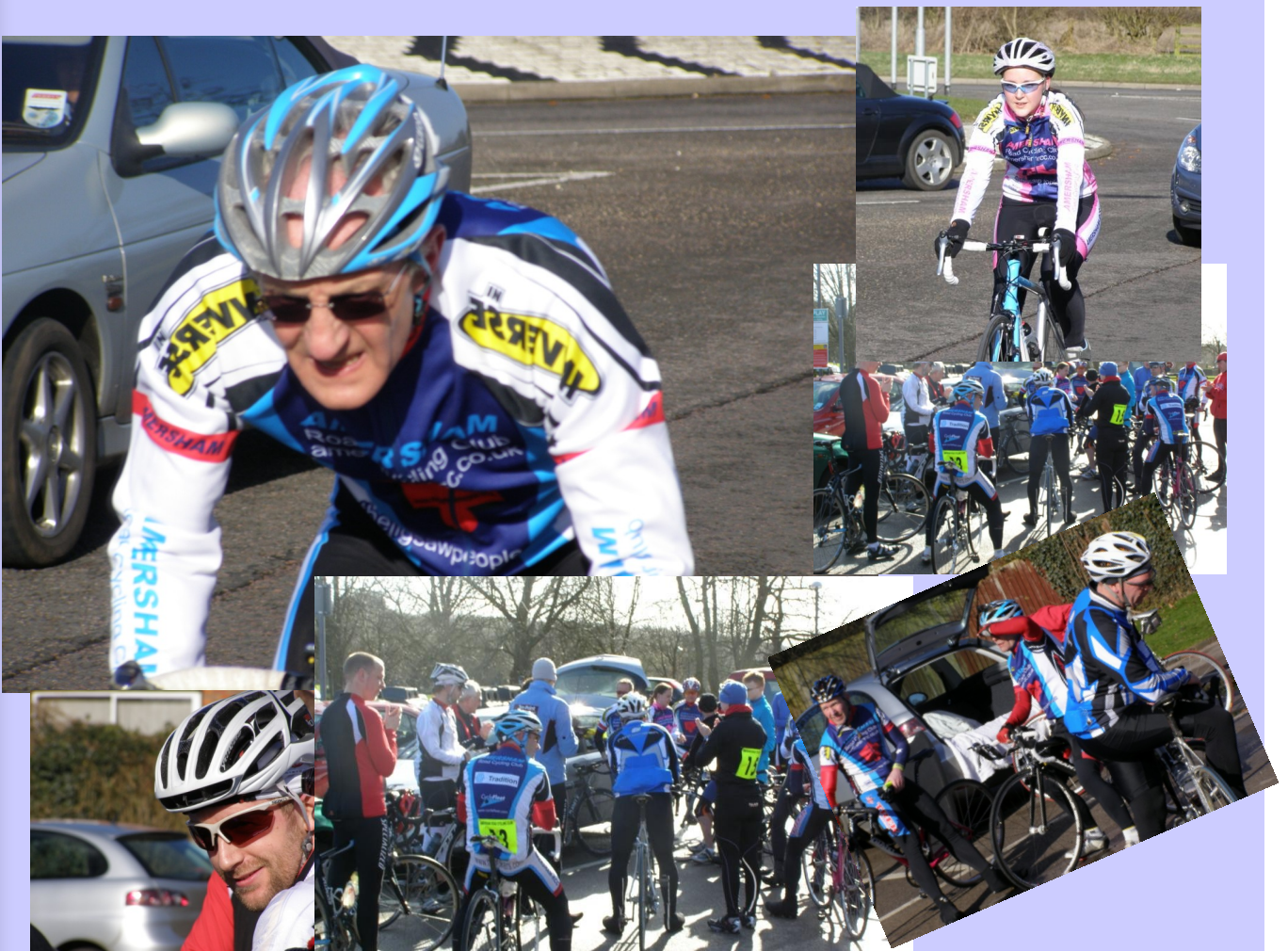
ARCC CLUB TIME TRIAL—March 2009